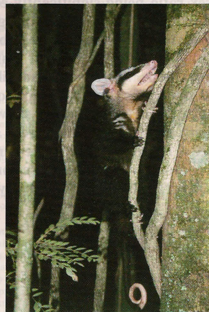
Figure 1. Individual of the white-eared opossum, Didelphis albiventris , in a tree in the COPEL area, Curitiba, southern Brazil.

The mean litter size was found to be 9.0 \pm 2.2 (range: 5 to 12; modal classes: 8 and 12; N = 14 litters). The mean number of teats was 11.3 ( N = 10 females). Two younger females (age class 3) weighing 550 and 575 g were seen with litters in January 1996 and February 1999. Two females with well-developed teats but without litters (young left in the den?) were trapped in September and November 1995.